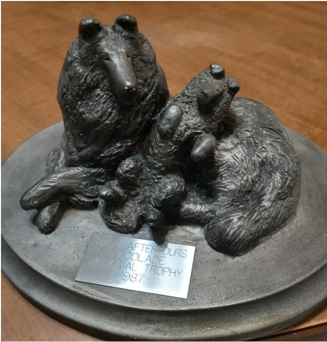
New Perpetual Trophy for Best in Sweepstakes