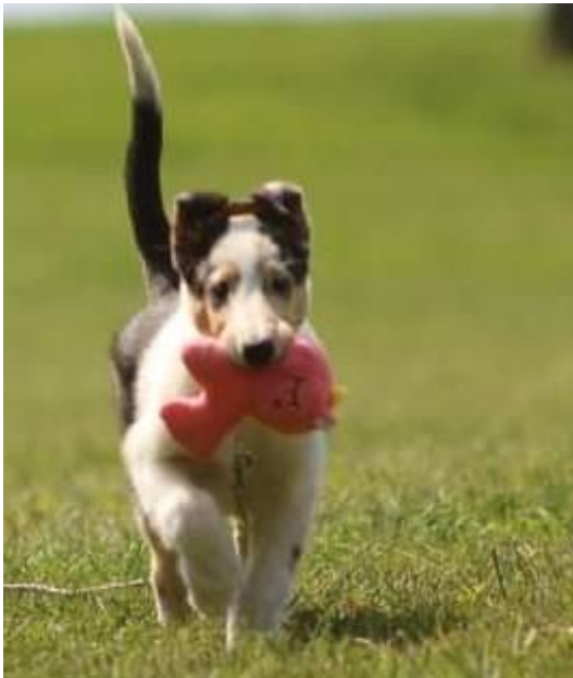
I'll trade you for it!